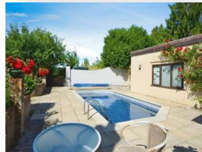
Kingbarrow View, Broxhill, Fordingbridge SP6 3DX