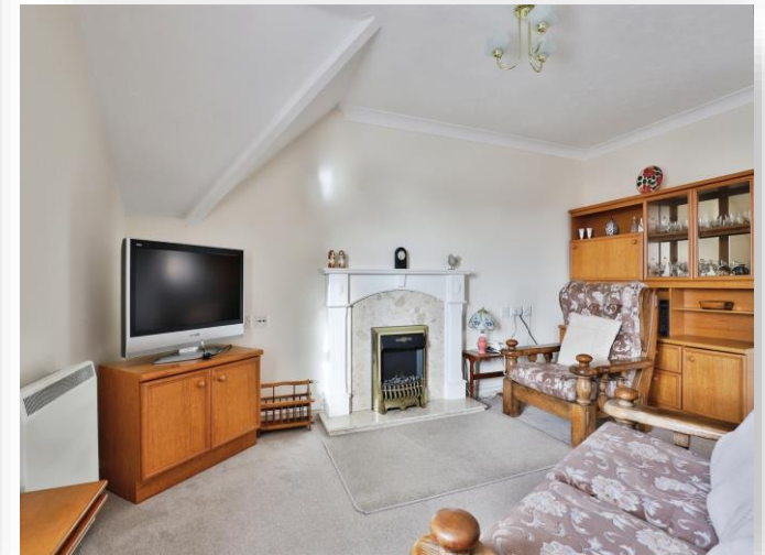
Kings Court, Salisbury Street, Fordingbridge SP6 1AL