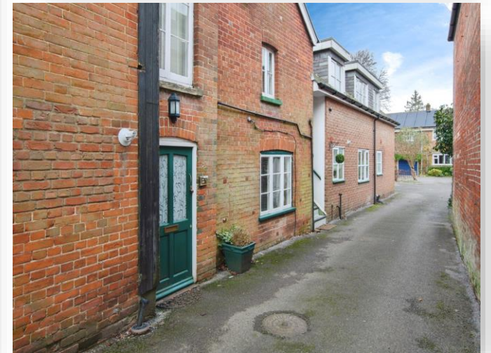
Bridge Court, Bridge Street, Fordingbridge SP6 1AH