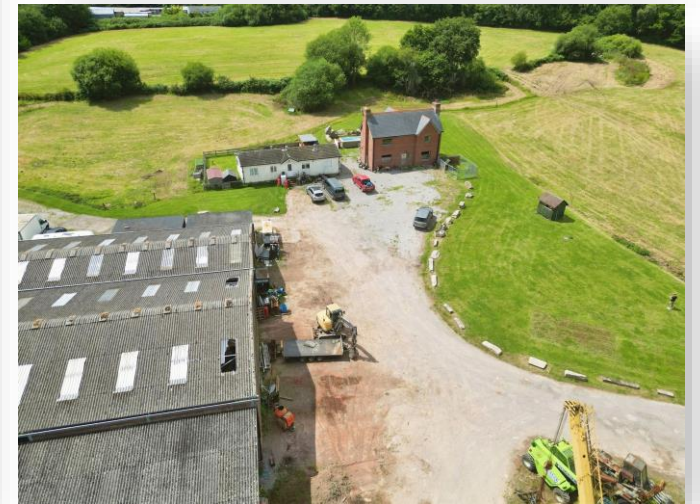
Ley Farm, Crendell, Fordingbridge SP6 3EB