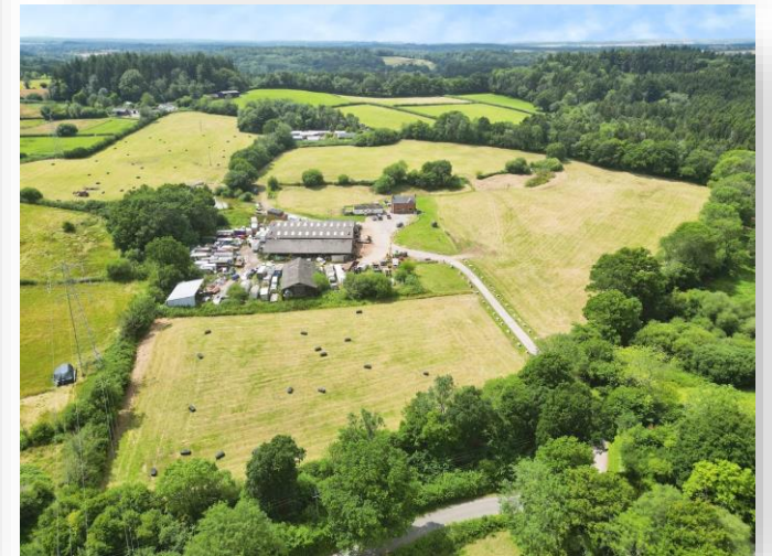
Ley Farm Crendell, Fordingbridge SP6 3EB