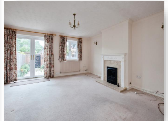
Cottage Mews, Fordingbridge SP6 1RJ