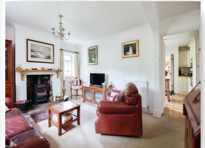
Park Lane, Alderholt, Fordingbridge SP6 3AJ