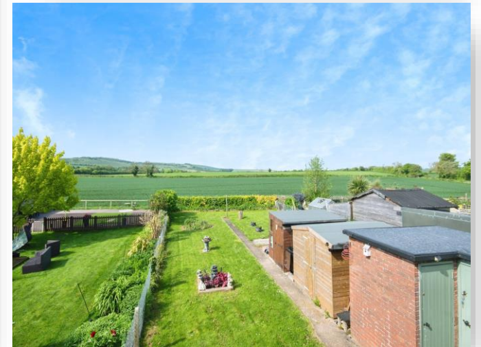
Downview Road, Martin Fordingbridge SP6 3LP