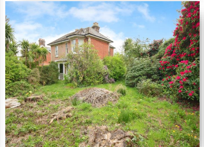
Station Road, Alderholt Fordingbridge SP6 3RB