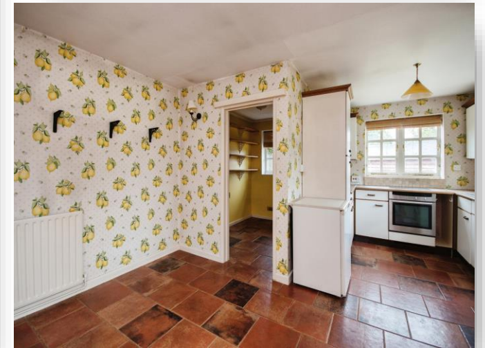
Bridge Cottage Salisbury Road, Burgate Fordingbridge SP6 1LX