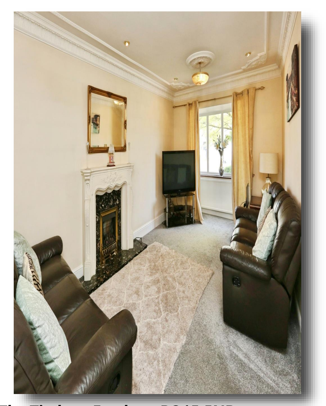
The Timbers, Fareham PO15 5NB