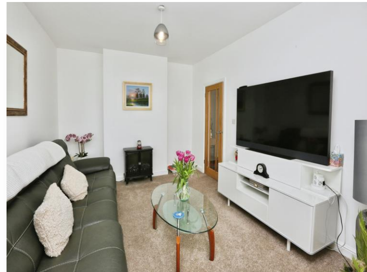
Gudge Heath Lane, Fareham PO15 6PZ