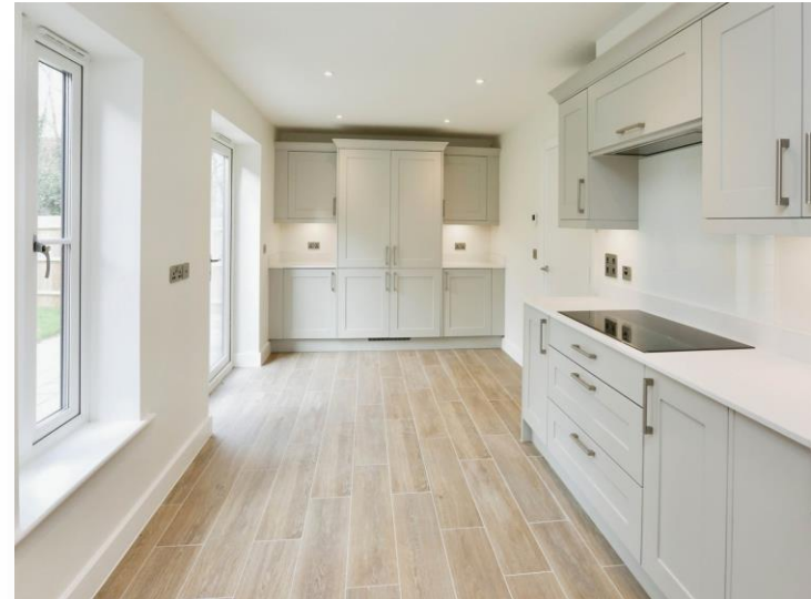
Lady Bettys Drive, Fareham PO15 6RJ