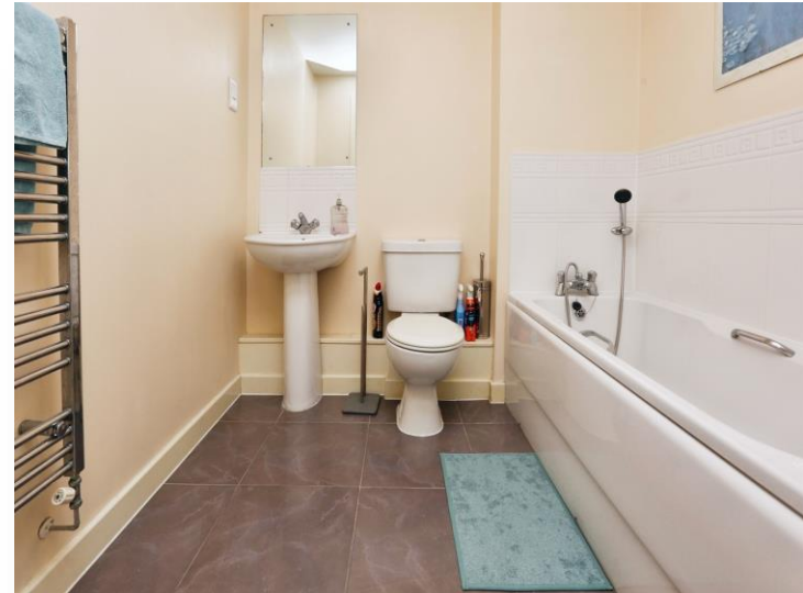
Wiltshire Square Park Cottage Drive, Fareham PO15 5BB