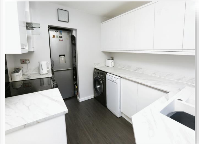
Heather Gardens, Fareham PO15 6JB