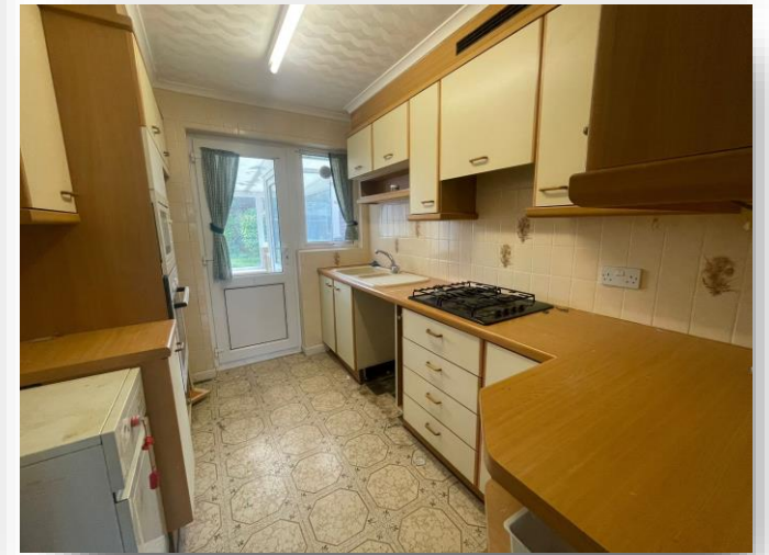
Mays Lane, Fareham, PO14 2ED