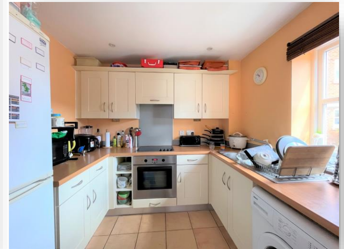
Cardingham Court, Consort Mews, Knowle, Fareham, PO17 5DU