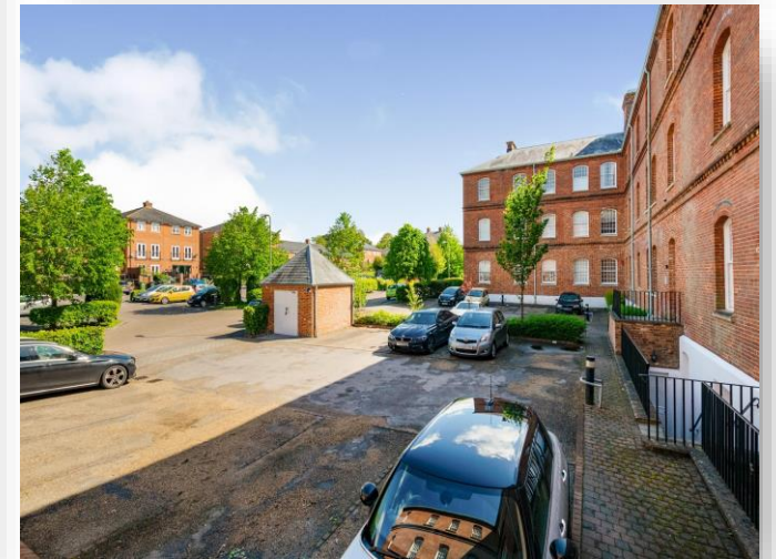
Kingswood Place, Knowle, Fareham PO17 5FG