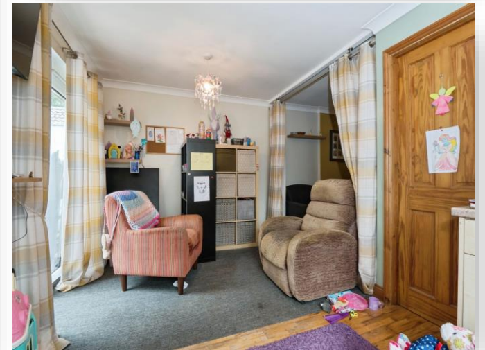
Kensington Close, Bishopstoke, Eastleigh. SO50 6NS