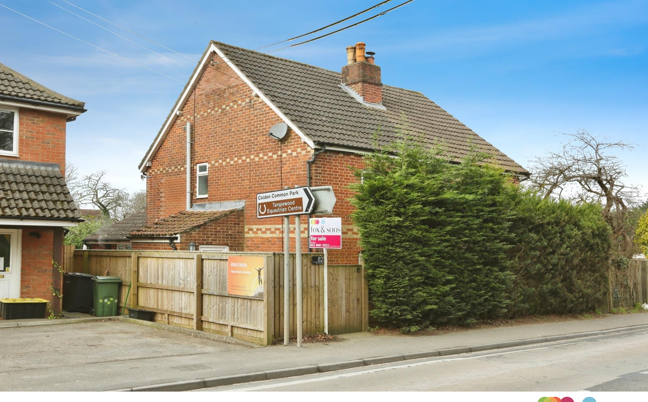
The Cottage Main Road, Colden Common Winchester SO21 1TD