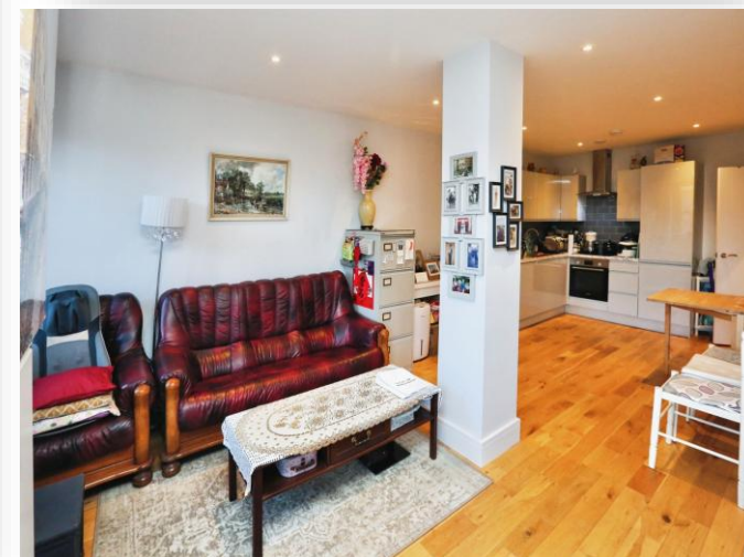
Mitchell House Southampton Road, Eastleigh SO50 9SD