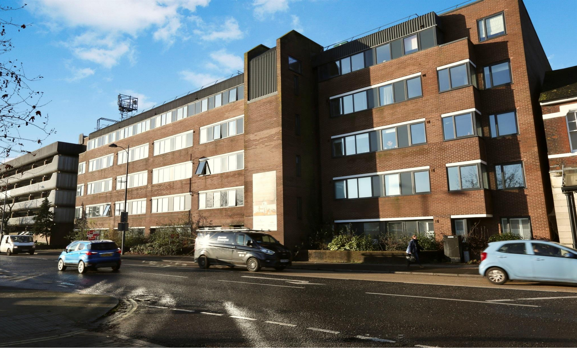
Mitchell House Southampton Road, Eastleigh SO50 9SD