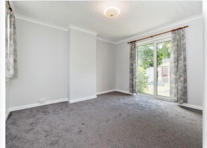
22 Greenfinch Close, Eastleigh, SO50 9JN