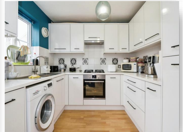
9 Heinz Burt Close, Eastleigh, SO50 5GB