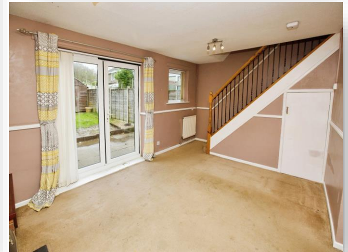
24 Olympic Way, Bishopstoke, Eastleigh, SO50 8PP