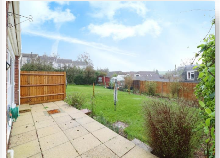
2 The Pastures, Kings Worthy, Winchester, SO23 7LU