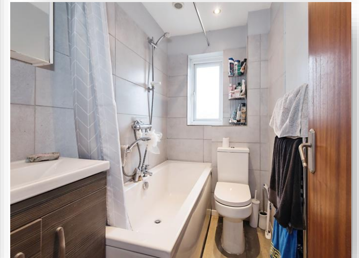
6 Rosebay Close, Horton Heath, Eastleigh, SO50 7PN