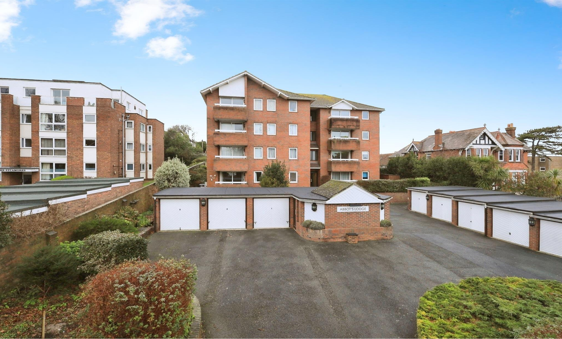
Abbots Lodge Arundel Road, Eastbourne BN21 2EL