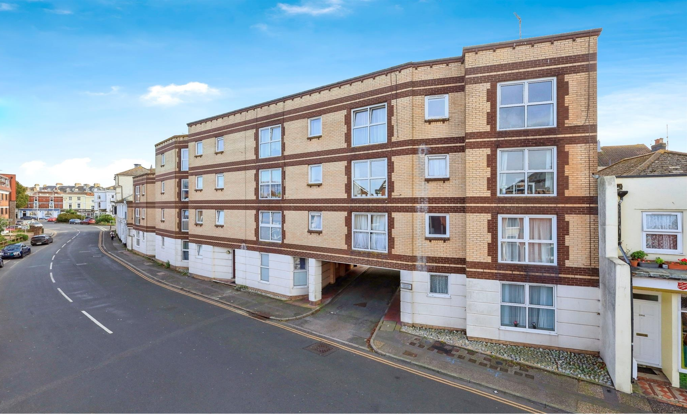
Phoenix Court Langney Road, Eastbourne BN22 8AJ