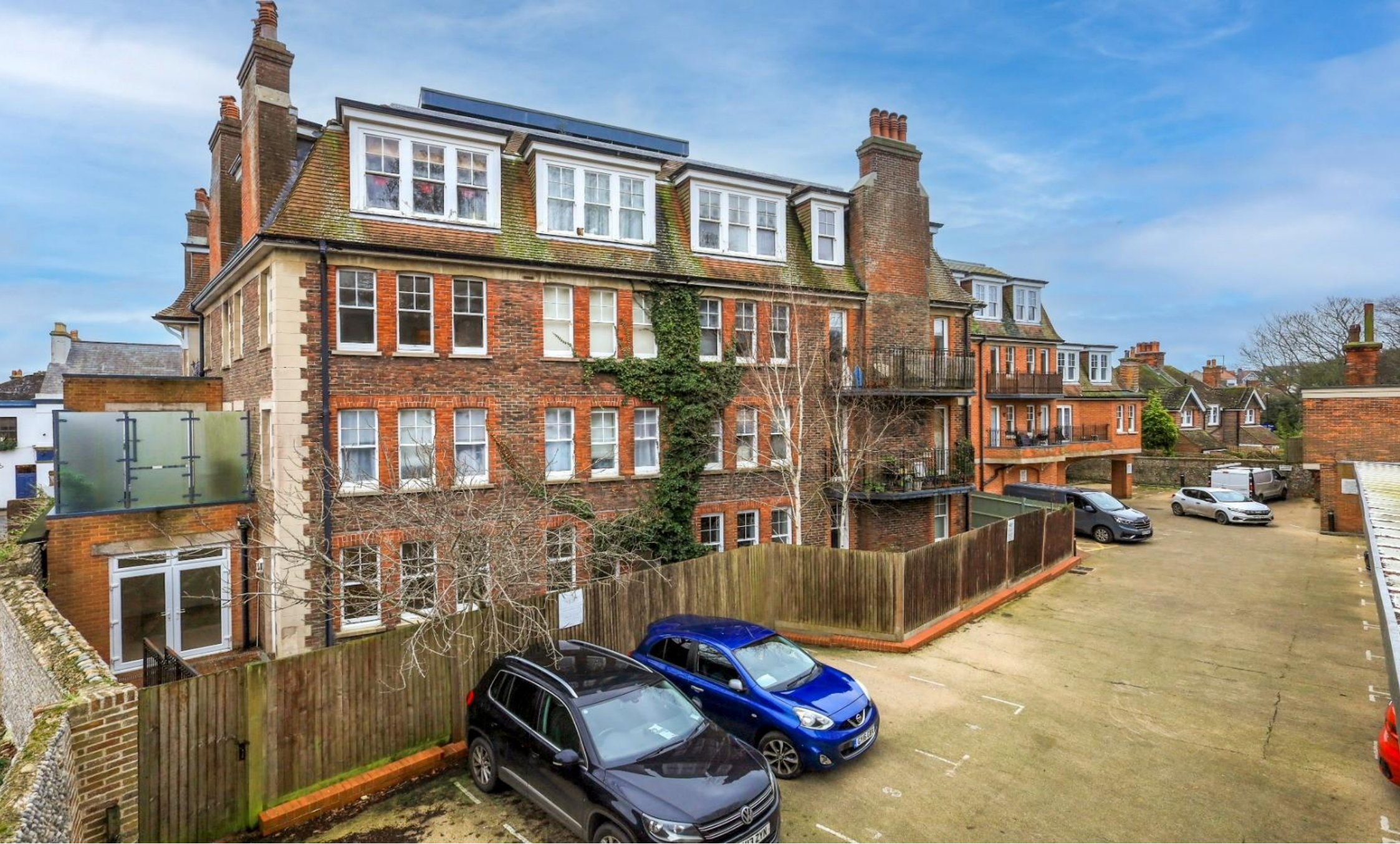
Downs Court Meads Street, Eastbourne BN20 7FD