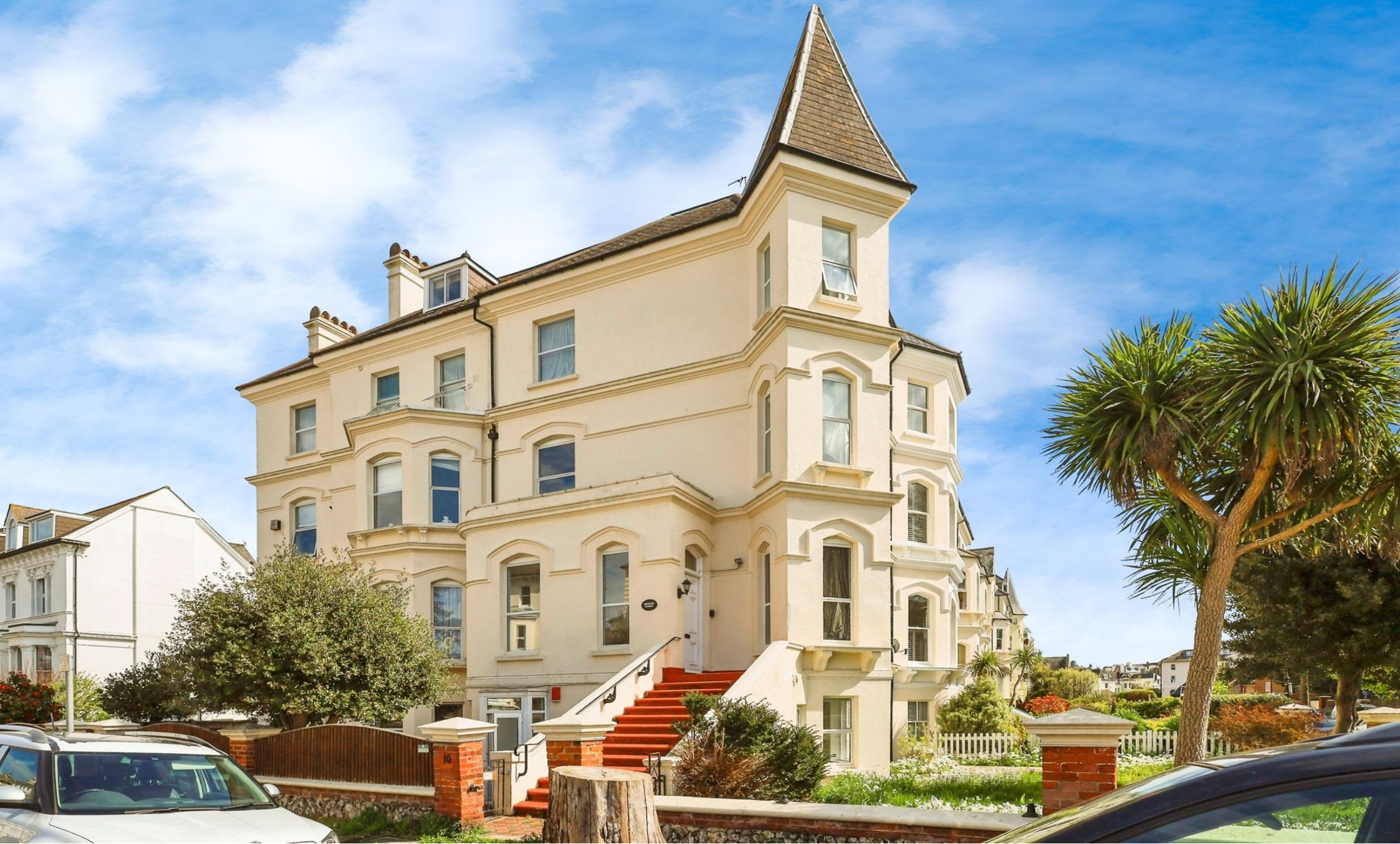
Spencer Lodge Spencer Road, Eastbourne BN21 4PA