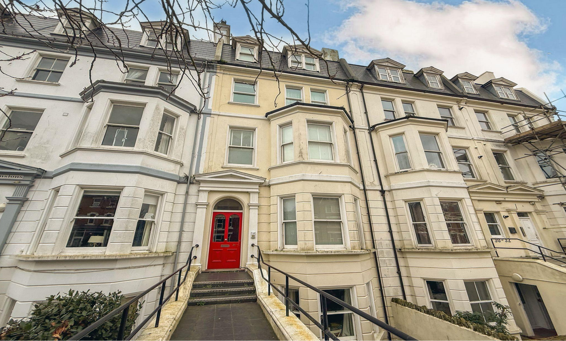
Luss House Jevington Gardens, Eastbourne BN21 4HN