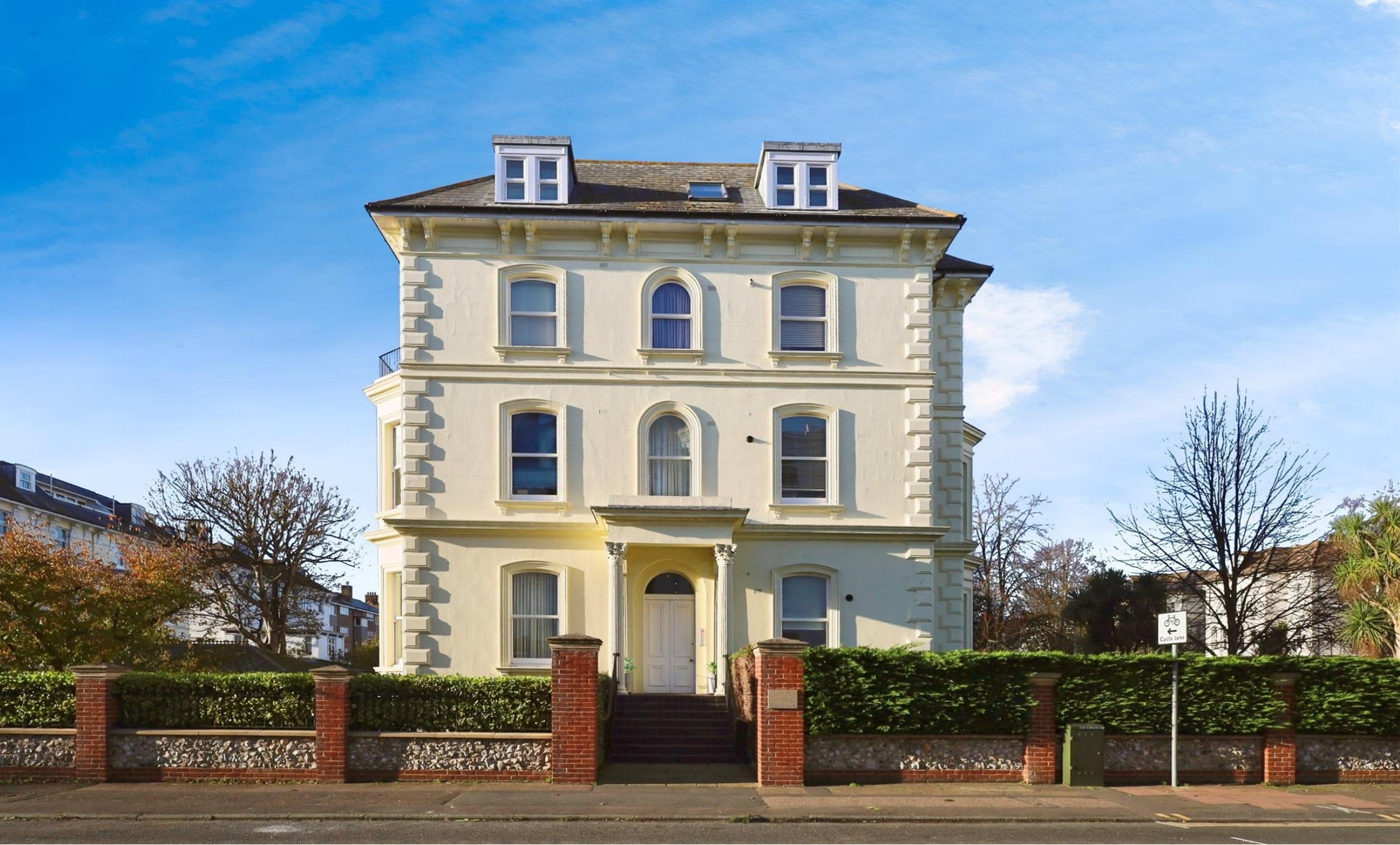
The Garden Court Devonshire Place, Eastbourne BN21 4BZ