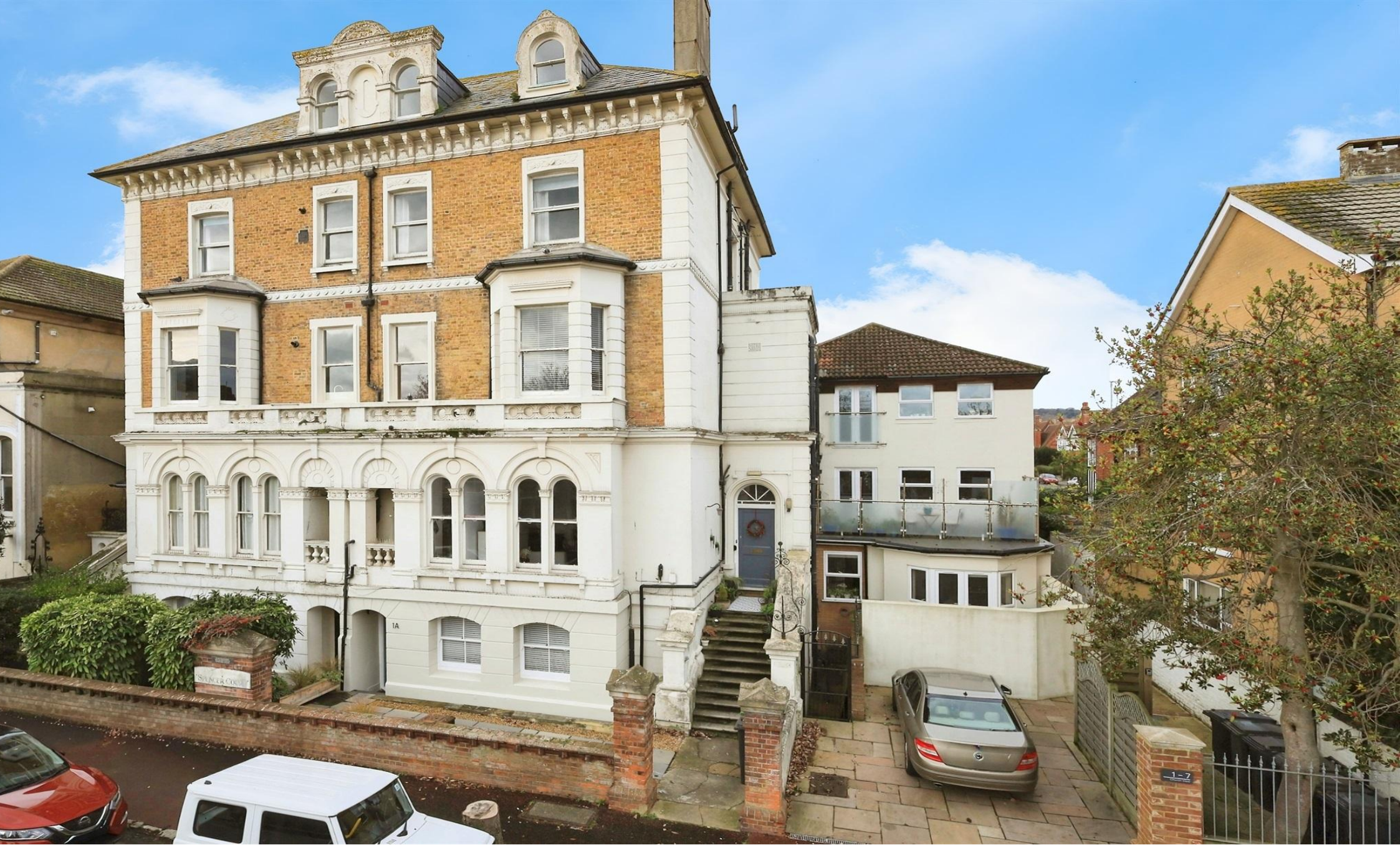
Church View Spencer Road, Eastbourne BN21 4FD