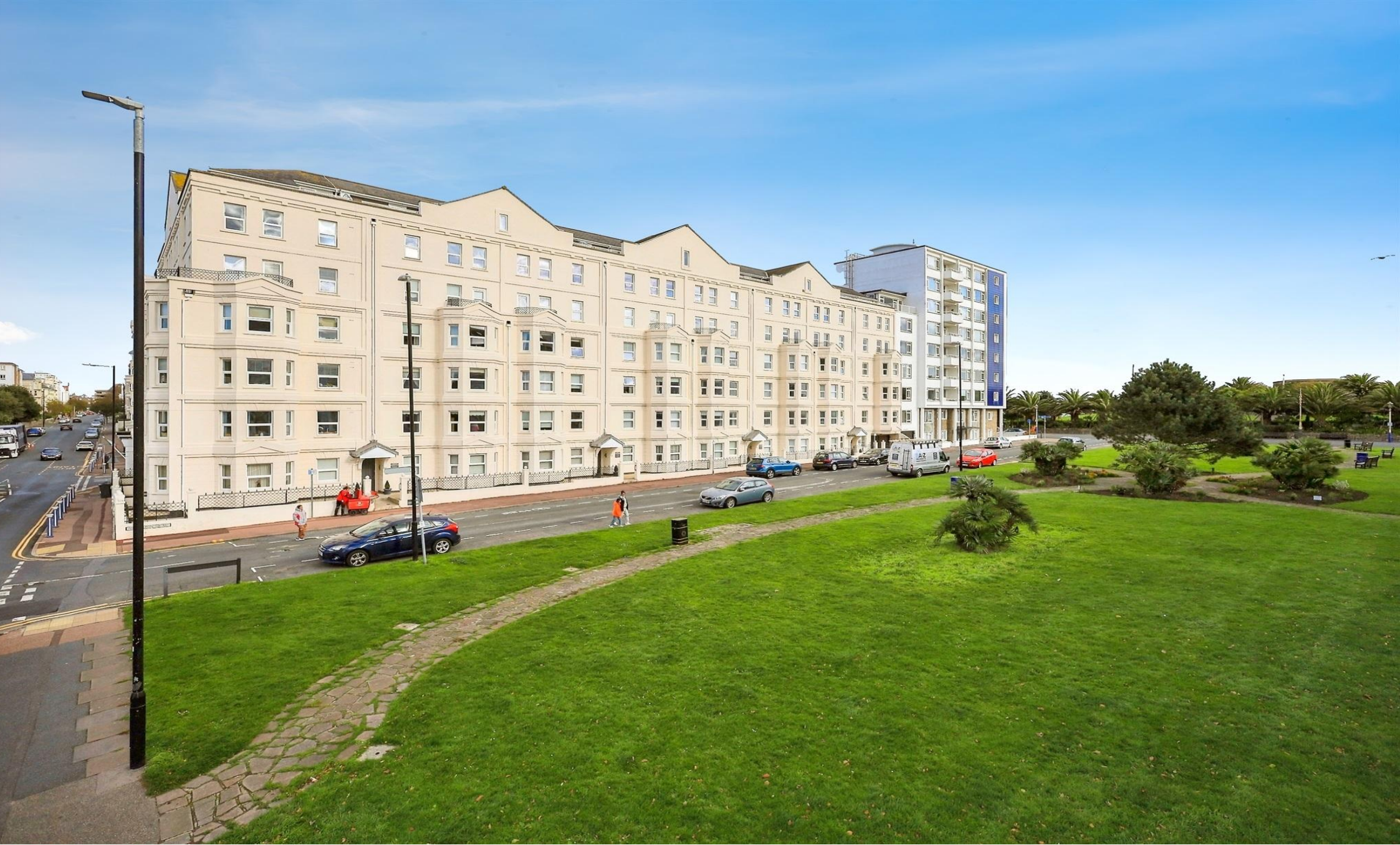
Berkeley Court Wilmington Square, Eastbourne BN21 4DX