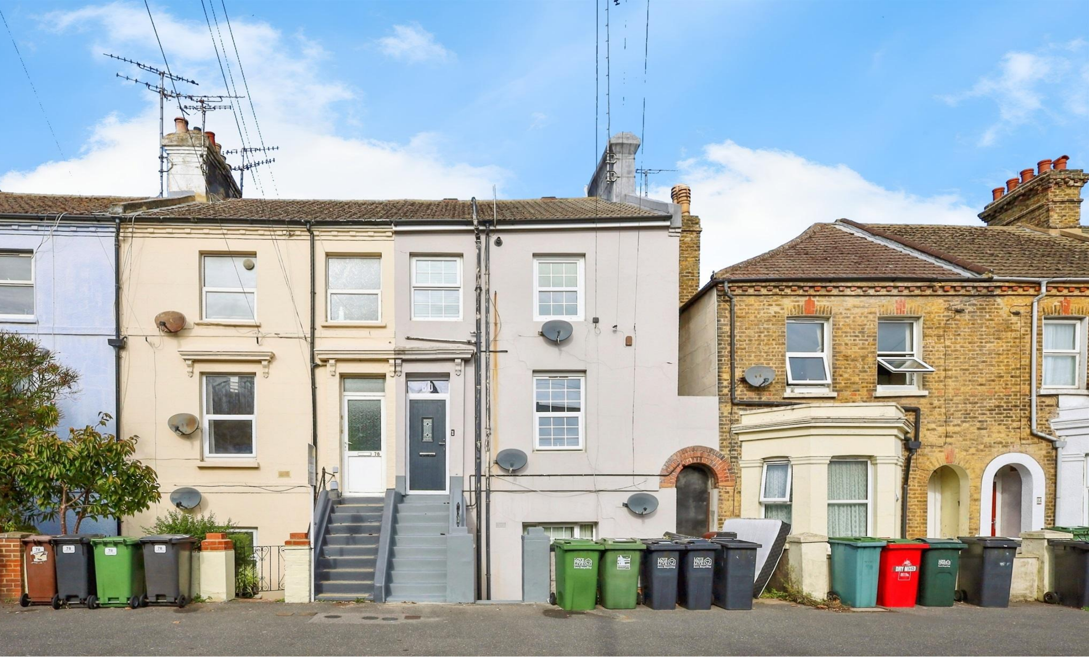
Ground Floor Flat Ashford Road,Eastbourne BN21 3TE