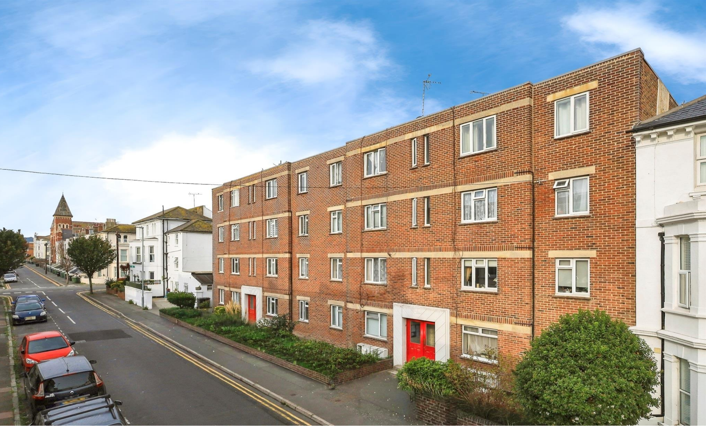
The Residence, Eastbourne BN22 8XX