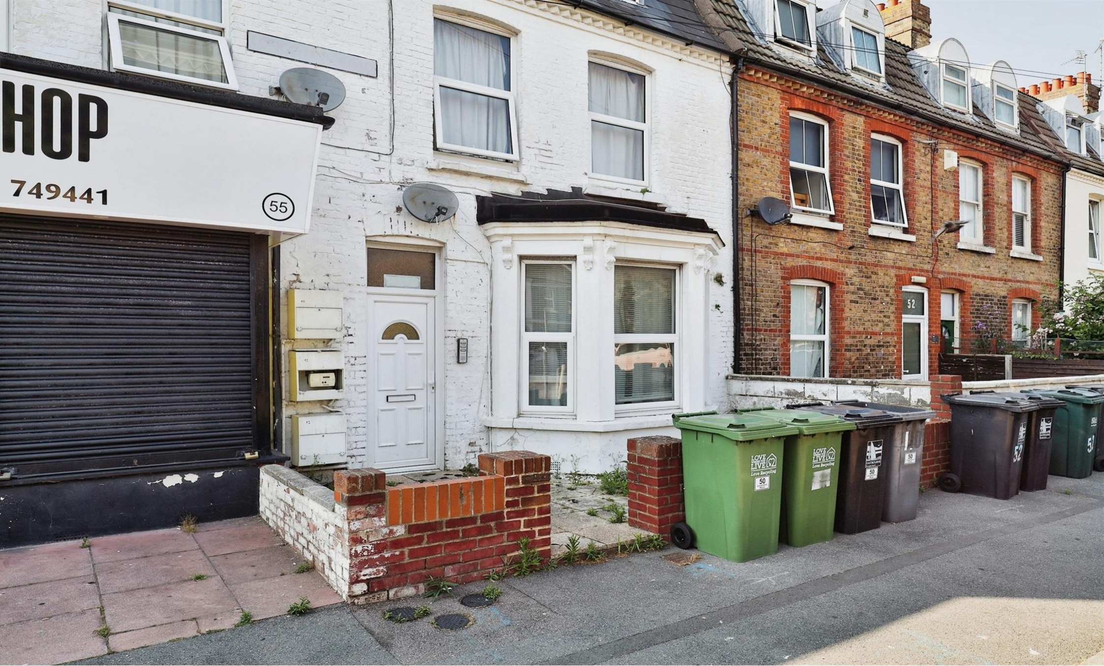
Longstone Road, Eastbourne BN21 3SL