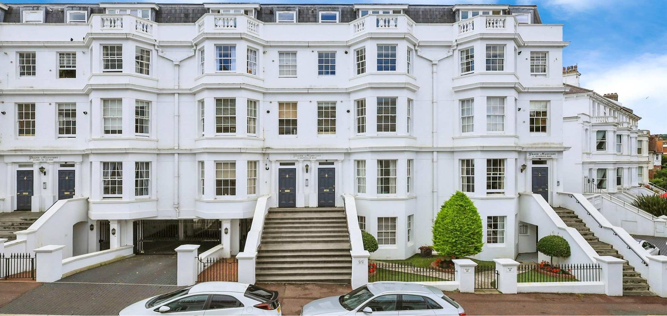
Grand Mansions Silverdale Road, Eastbourne BN20 7AD