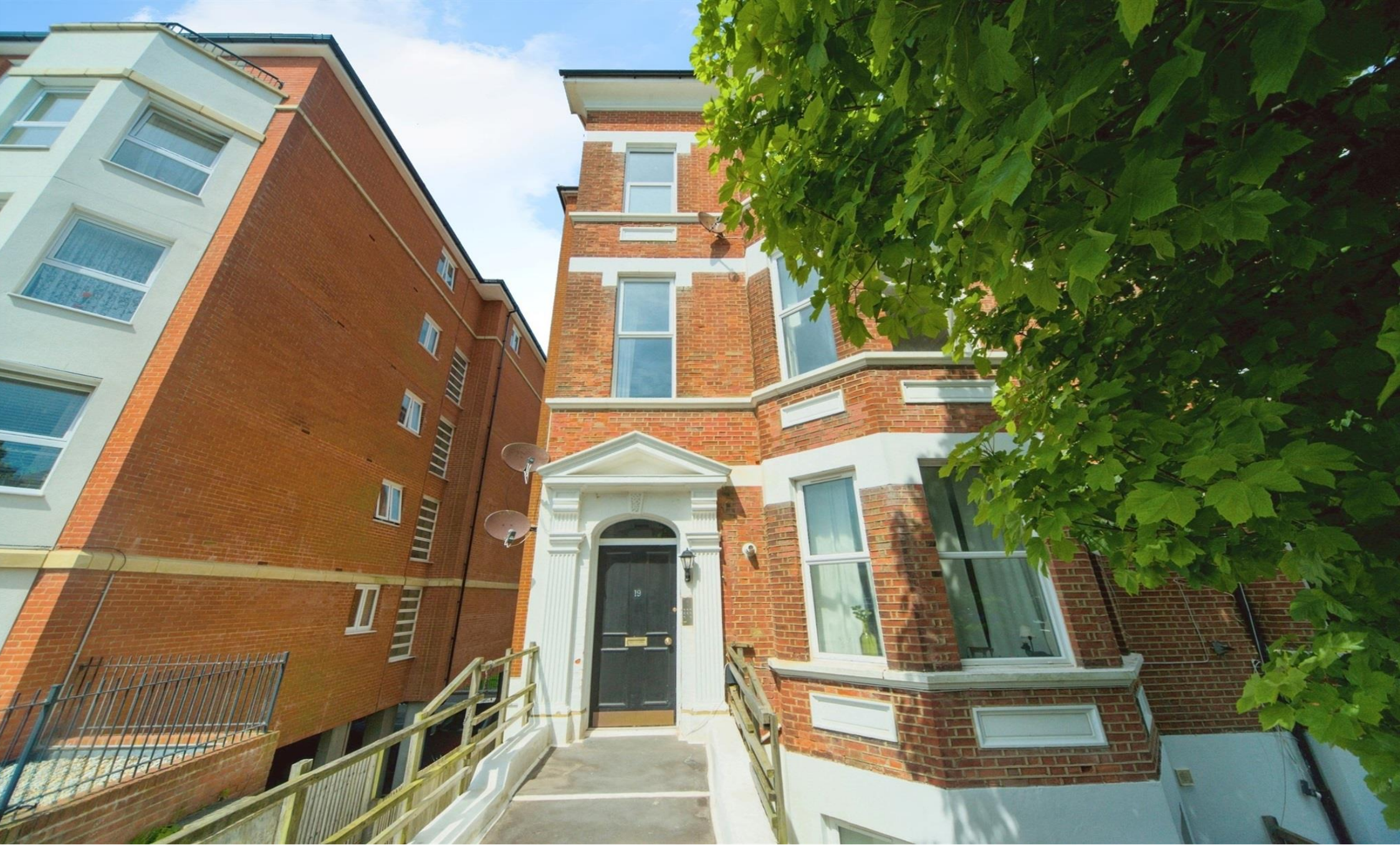
Jevington Gardens, Eastbourne BN21 4HR