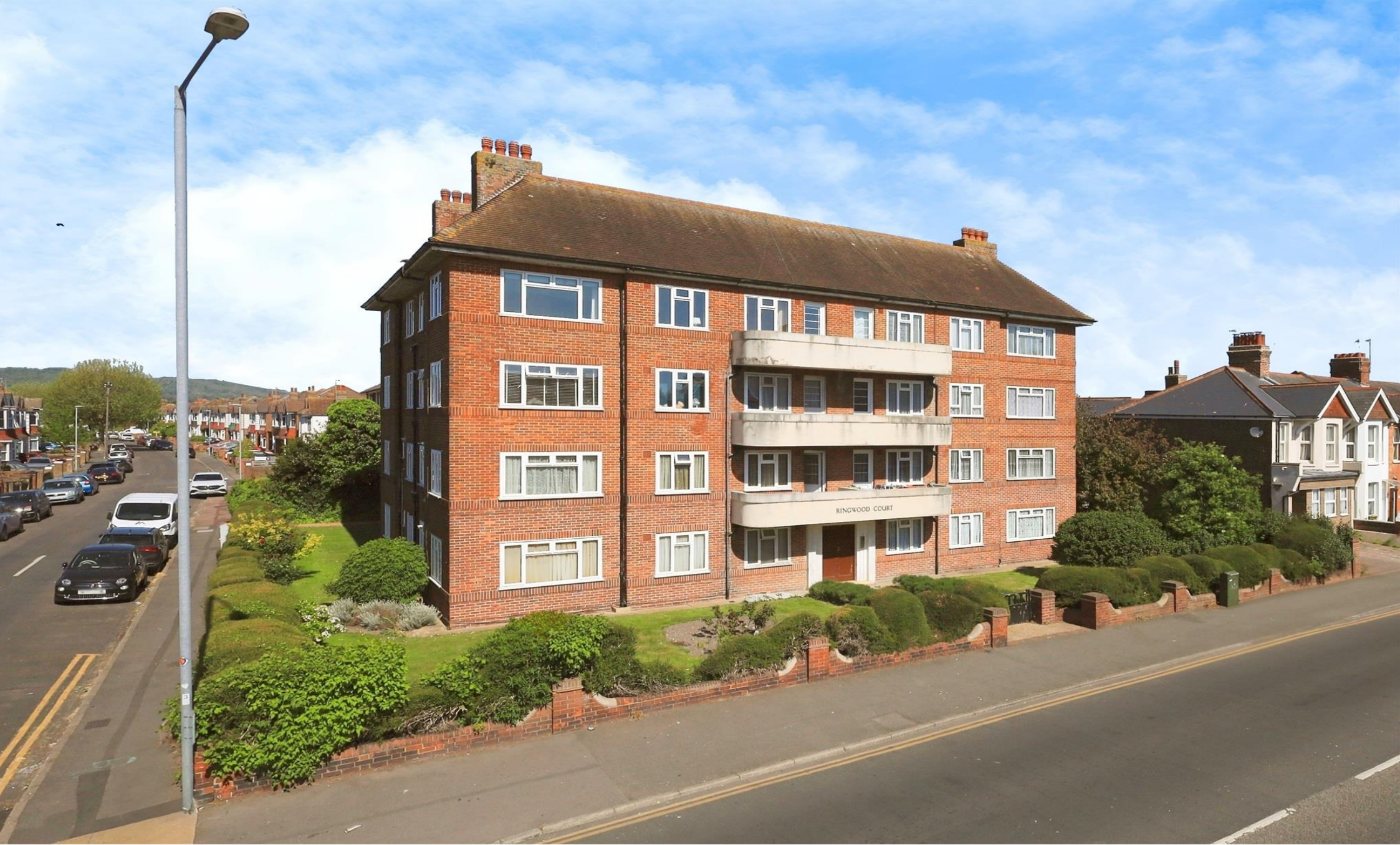
Ringwood Court, Eastbourne BN22 7RB