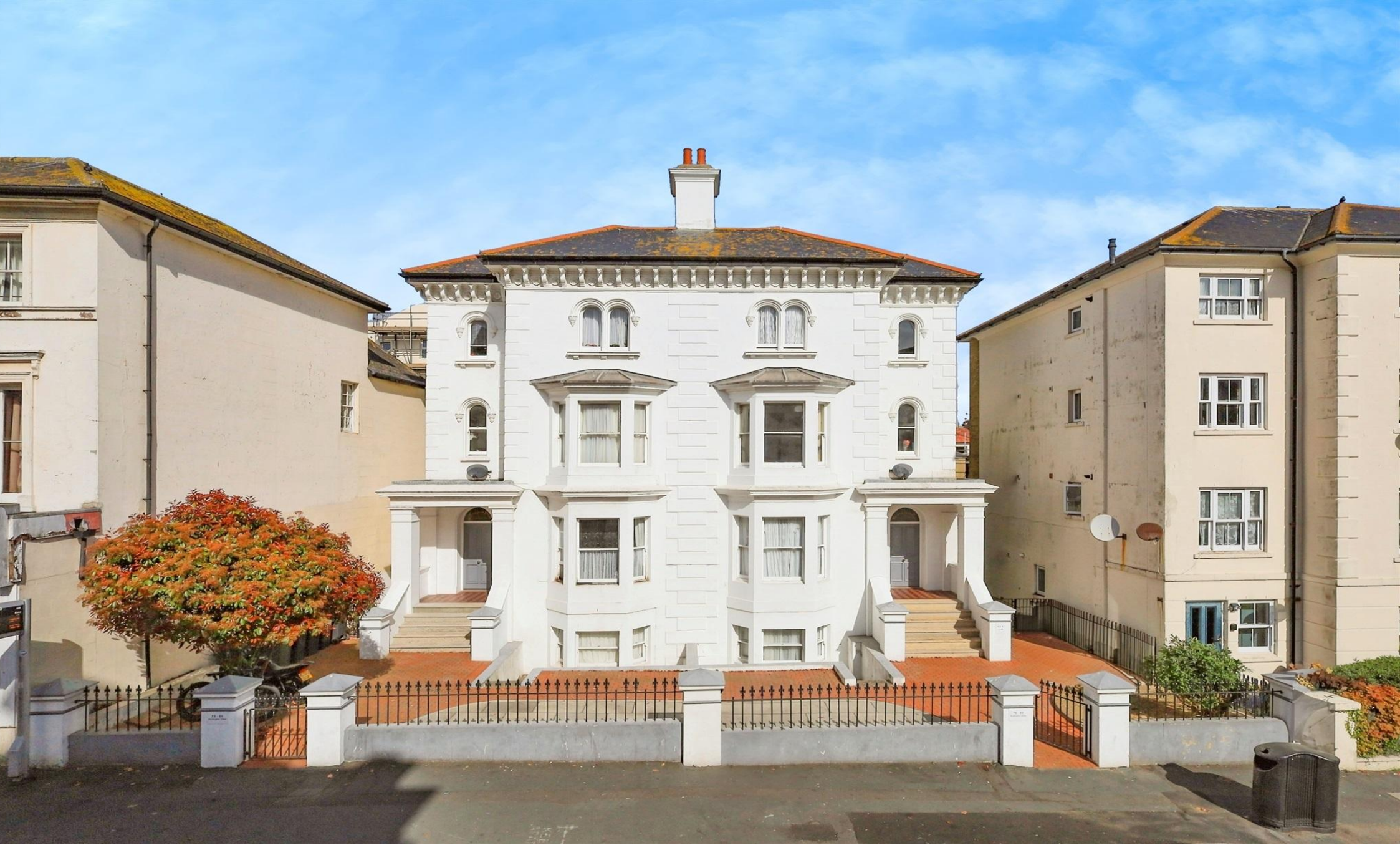
Burlington Villas Seaside Road, Eastbourne BN21 3PZ