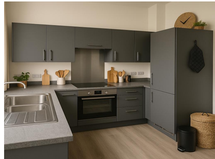
The Esperance Hartington Place, Eastbourne BN21 3BW