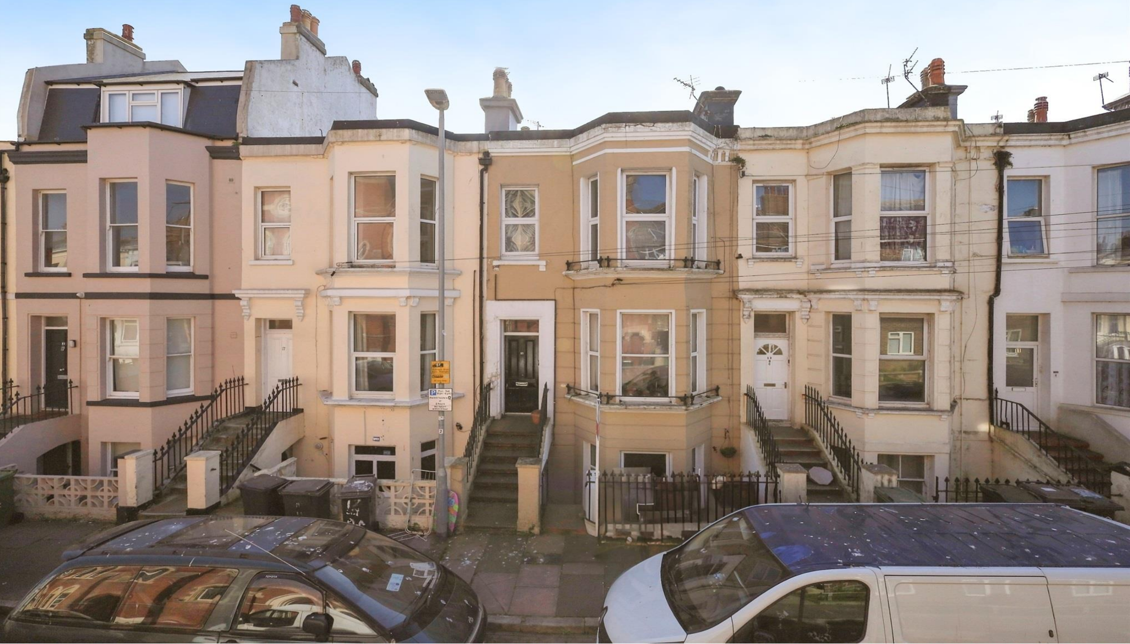
Ceylon Place, Eastbourne, BN21 3JE