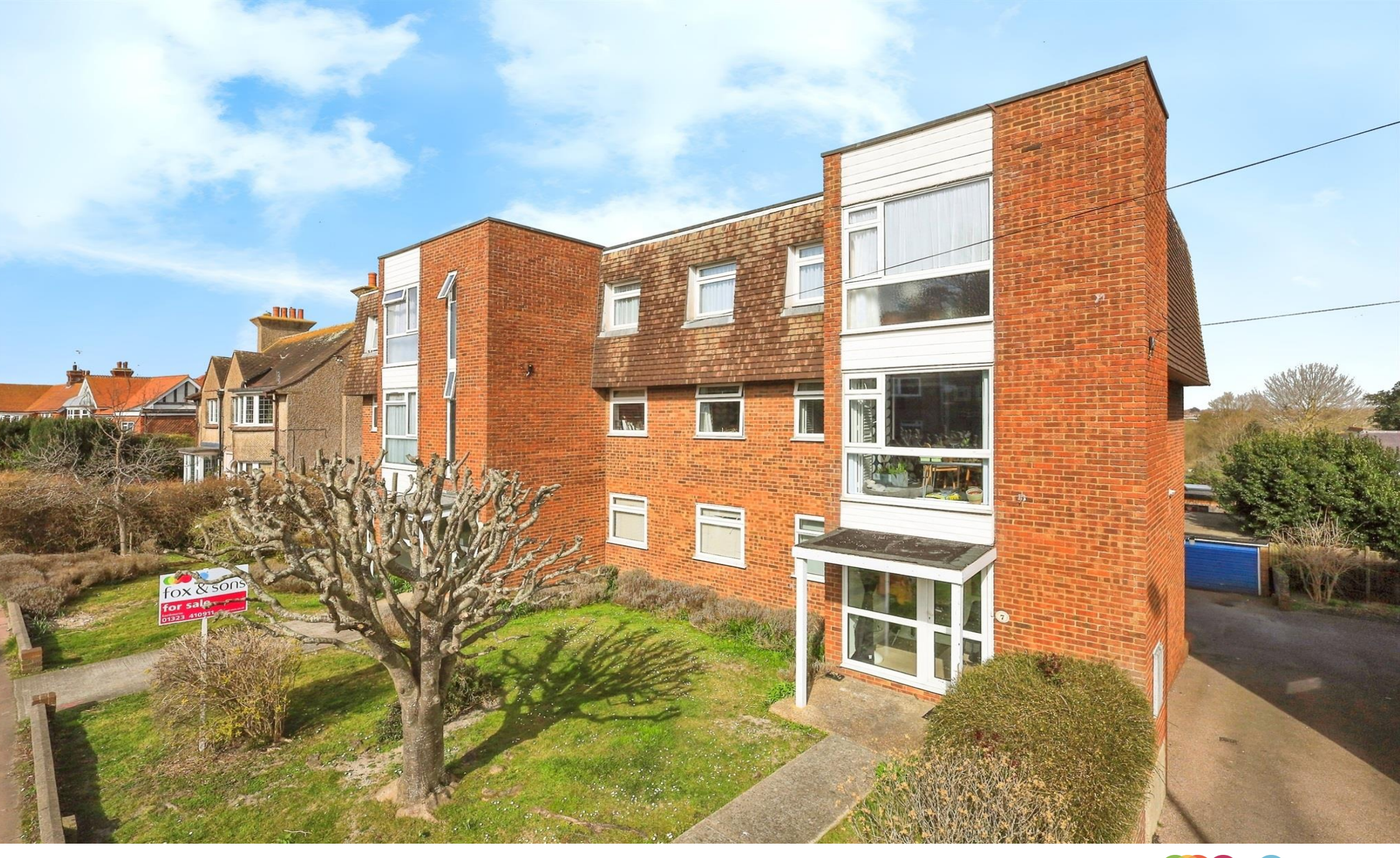
Embassy Court Lewes Road, Eastbourne BN21 2BU