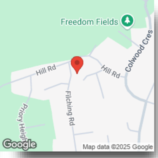
Please note the marker reflects the postcode not the actual property