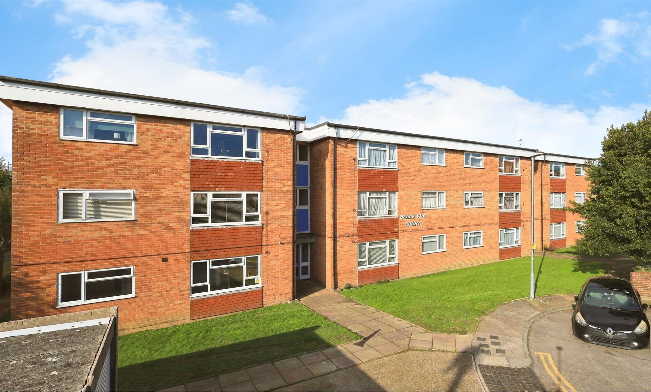
Belle Vue Court Belle Vue Road, Eastbourne BN22 7RF