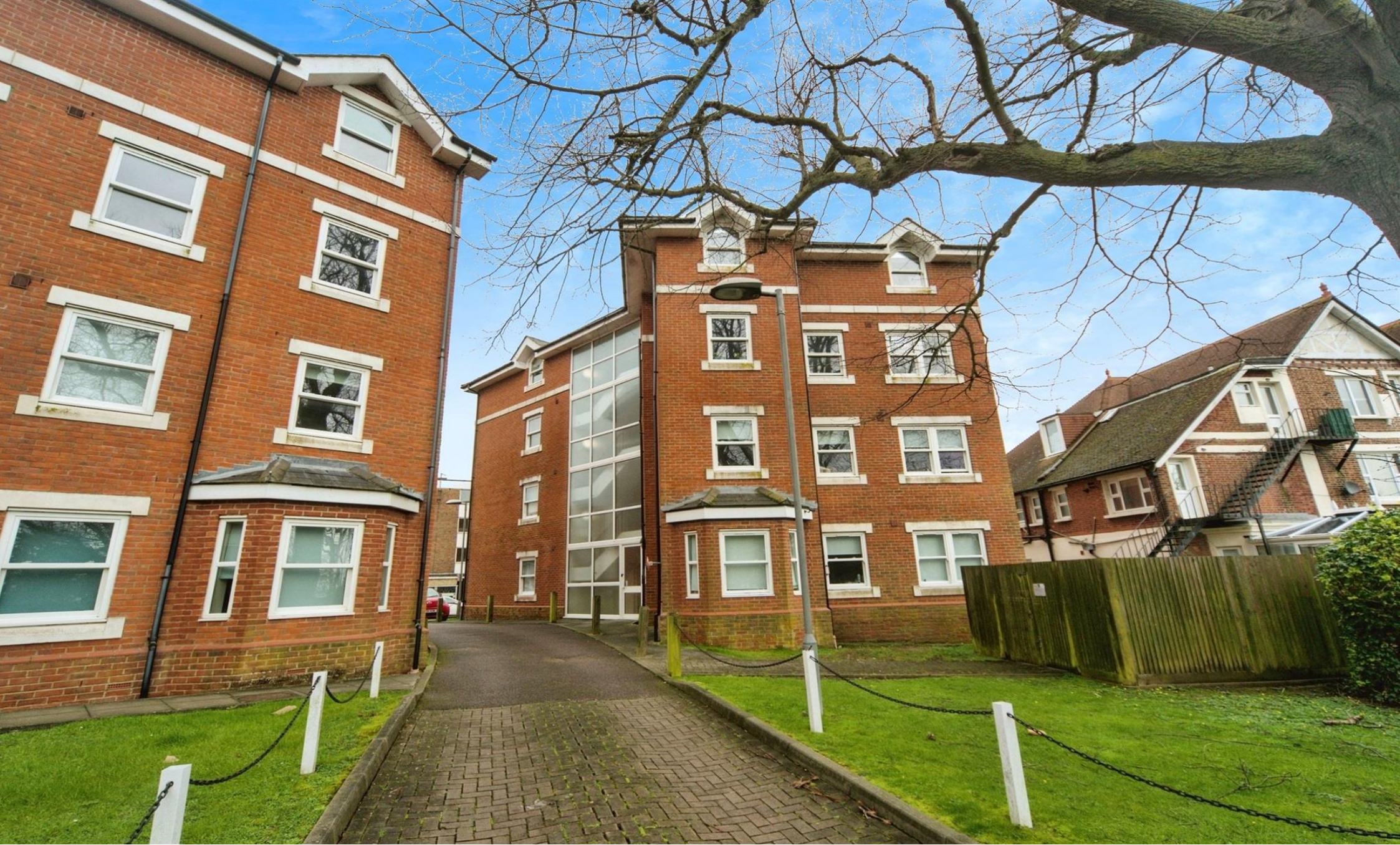
Preston Court Upper Avenue, Eastbourne BN21 3ZE