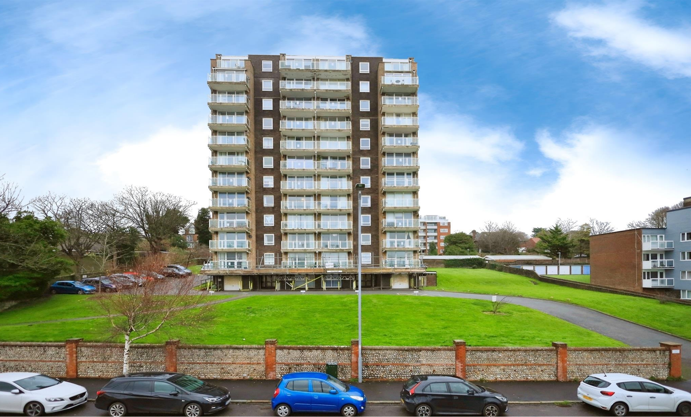
South View Upperton Road, Eastbourne BN21 1LG