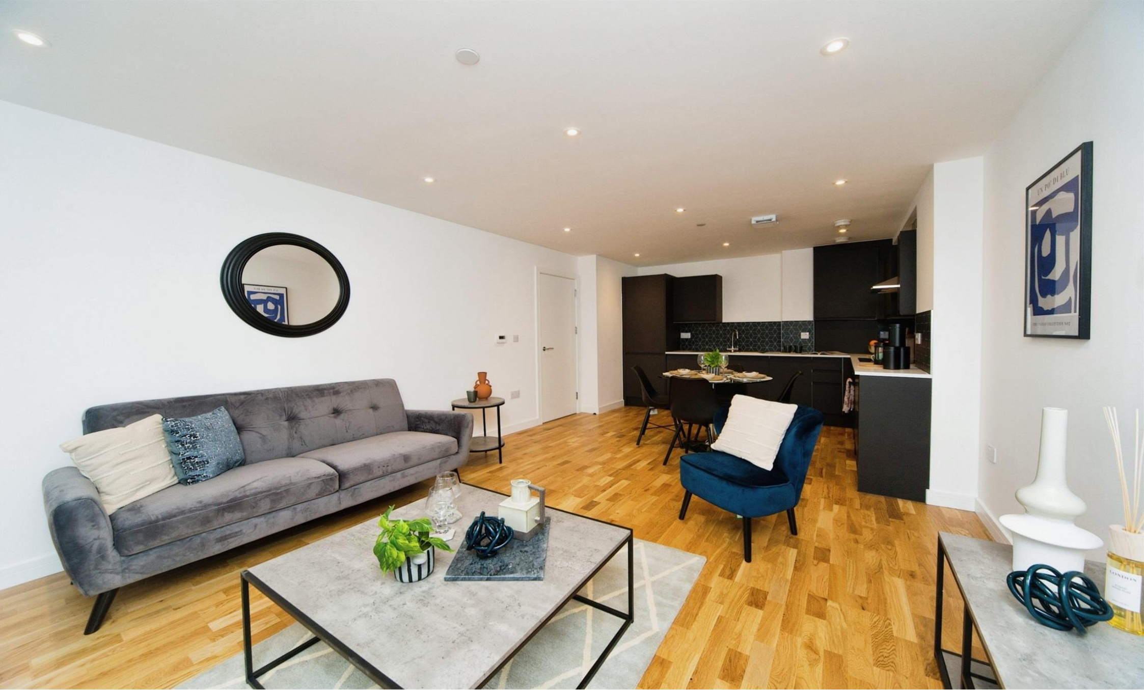
Solitaire House Upperton Road, Eastbourne BN21 1LP